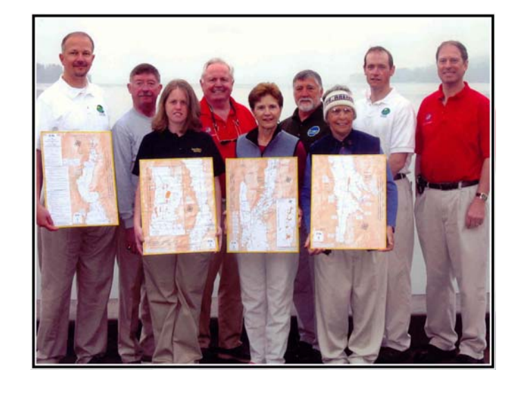
Chart Committee unveils new 2008 LGPS Chart