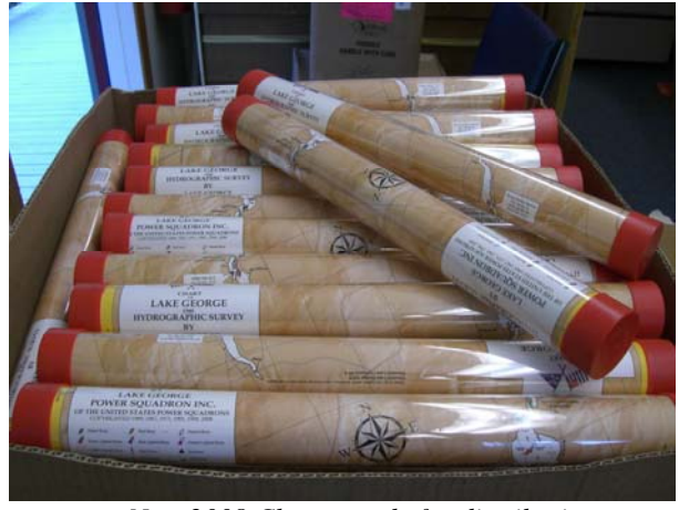
New 2008 Charts ready for distribution