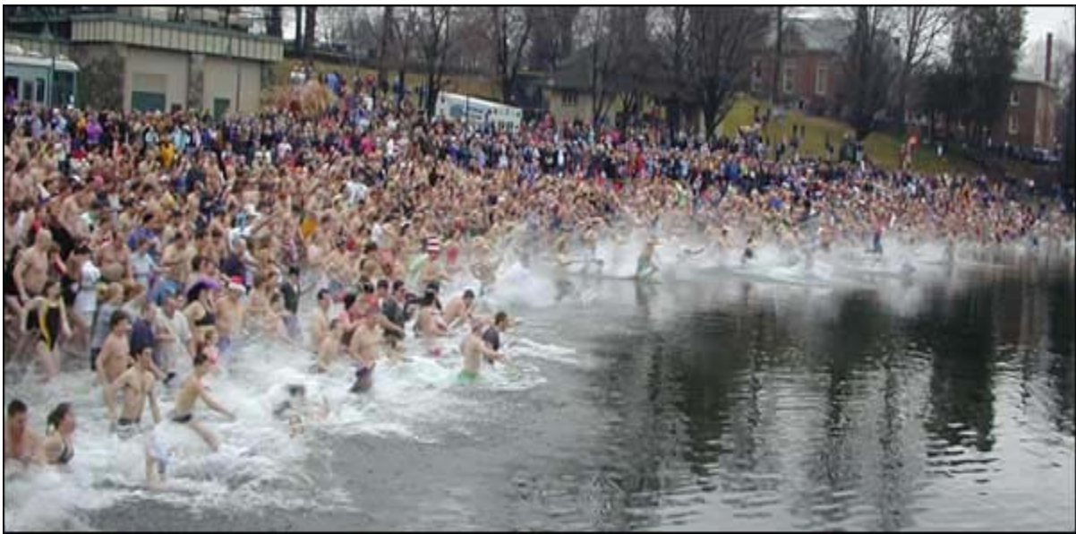
Ready Set Go!!! "First Day" Polar Plunge, Jan. 1, 2007