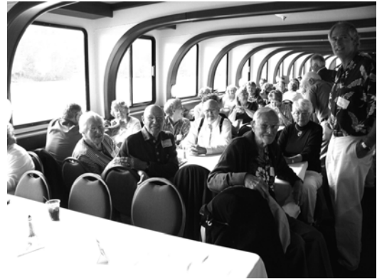
2004 Adirondac dinner cruise, Lake George