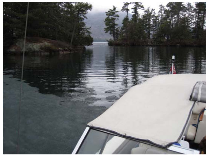
Paradise Bay - Lake George Ice-Out camping trip March 17, 2012

Right now, nothing can happen without the consent of the Department of Environmental Conservation, which operates the Mossy Point and Rogers Rock launches on Lake George. So I strongly suggest boaters make their feelings known before it's too late. If it happens here, it can happen on other waters. REPRINTED WITH PERMISSION