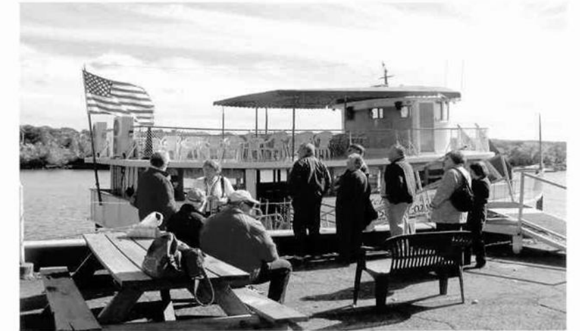
DUTCH APPLE is almost ready for our Squadron members to board. Lunch was served after we were underway.