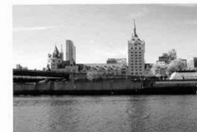
DELEWARE & HUDSON BUILDING dominates Albany's beautiful skyline soon after we embark.