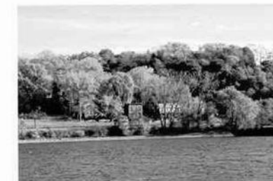
AUTUMN COLORS surround quaint river town on the east shore as we proceed down the Hudson.