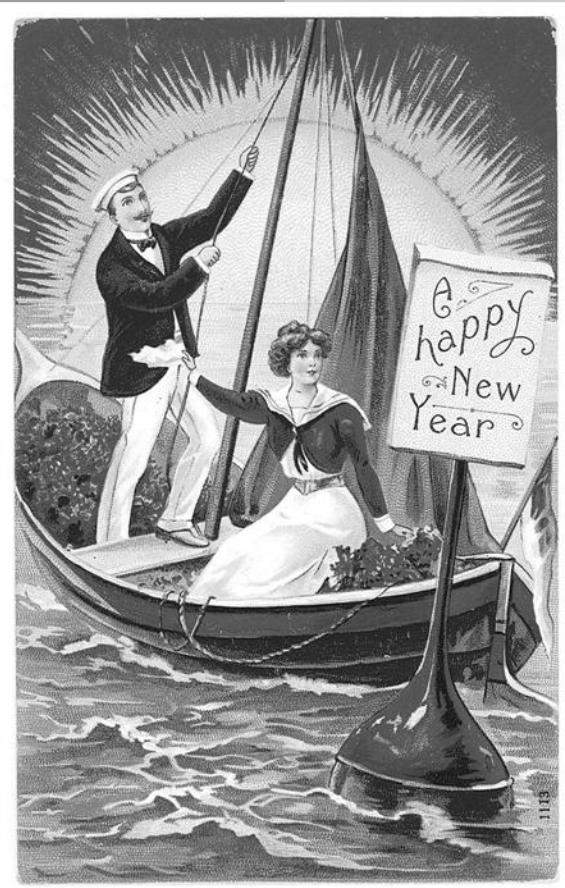
6 Lake George Power Squadron