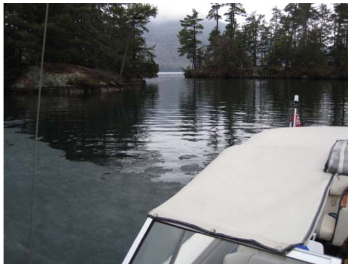
Paradise Bay - Lake George Ice-Out camping trip March 17, 2012

Right now, nothing can happen without the consent of the Department of Environmental Conservation, which operates the Mossy Point and Rogers Rock launches on Lake George. So I strongly suggest boaters make their feelings known before it’s too late. If it happens here, it can happen on other waters. REPRINTED WITH PERMISSION